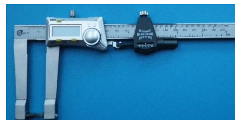
FMS special caliper